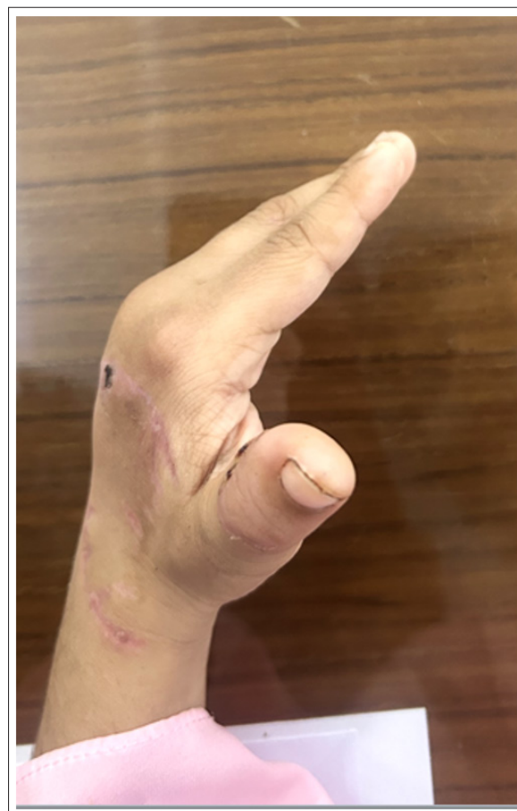
Figure 4: Range of extension of the left hand two weeks post-surgery showing progressive recovery.