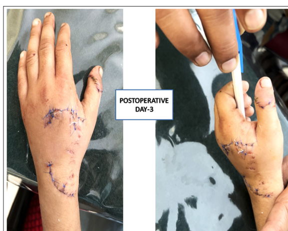
Figure 3: Initiation of controlled passive and active range of motion exercises under physiotherapist supervision.