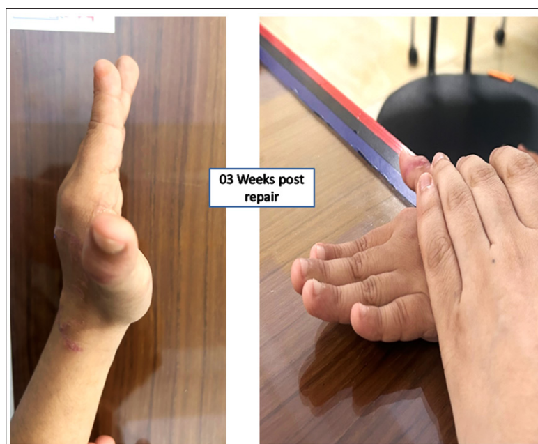
Figure 5: Range of extension of the left hand three weeks post-repair, showing full restoration of movement.